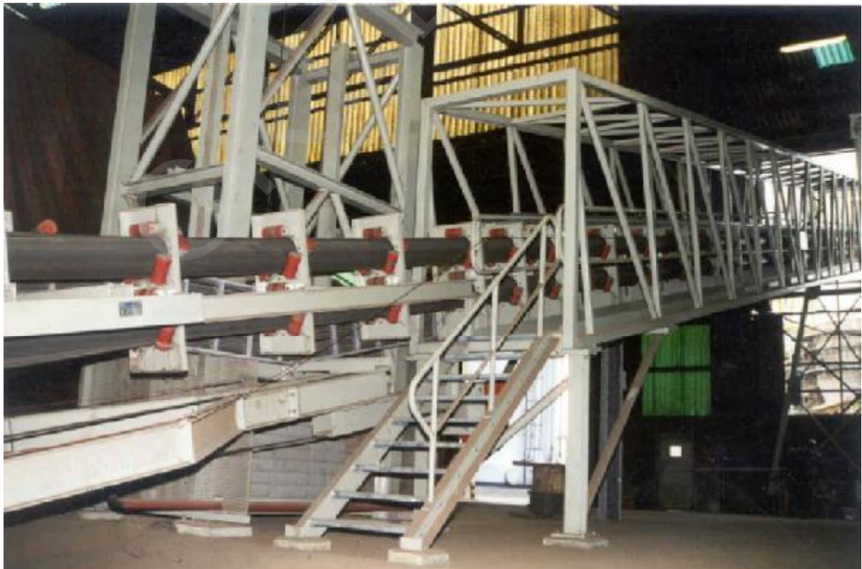
Pipe-conveyor at Pasmenco Budel Zink