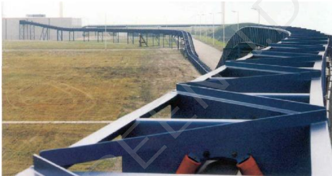
Pipe-conveyor near Rotterdam the Netherlands

Pipe-conveyors have been installed so far for capacities up to 3000 t/h with a pipe-diameter of 700 mm. The maximum length for one system is approx. 5,000 meters.